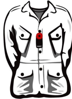
C5 Field training uniform

The poppy is to be worn on the left pocket flap of the shirt, centered over the button.